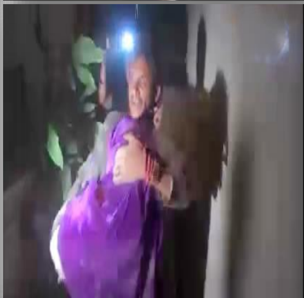
A report documenting the crime of bombing Ali Al-Juthim family in Al-Salam area by the Saudi coalition warplane in Amran