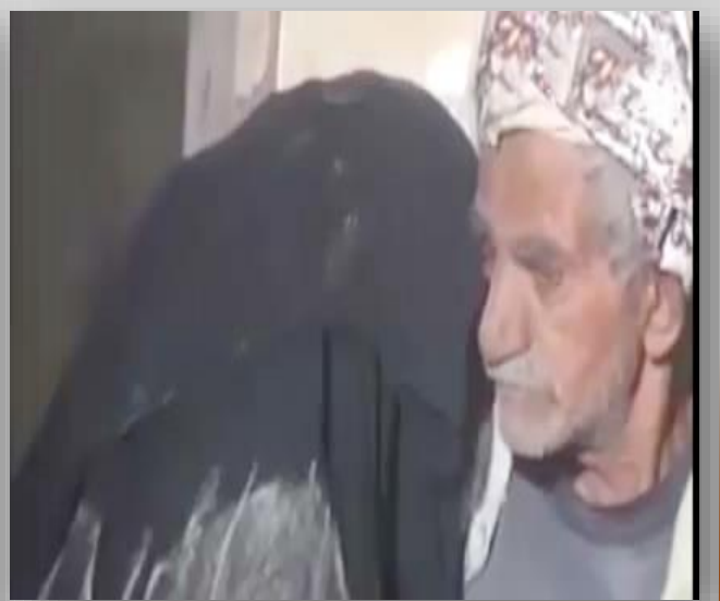
A report documenting the crime of bombing Ali Al-Juthim family in Al-Salam area by the Saudi coalition warplane in Amran