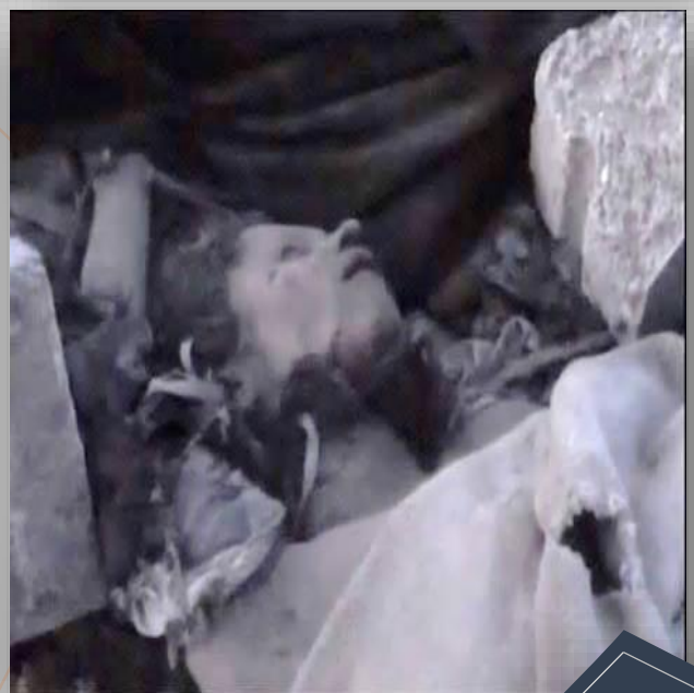
This report documented the crime of bombing civilians' houses in Al-Ara area at Sana'a governorate by the Saudi coalition warplanes