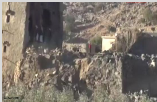
I am Sorry!!!!