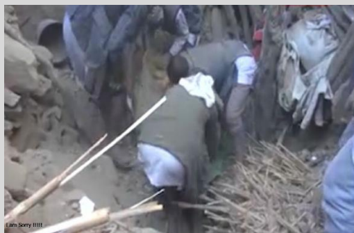
I am Sorry!!!!