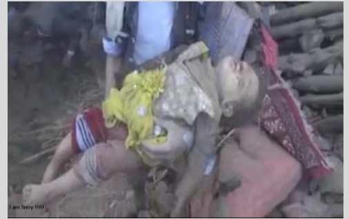
I am Sorry!!!!