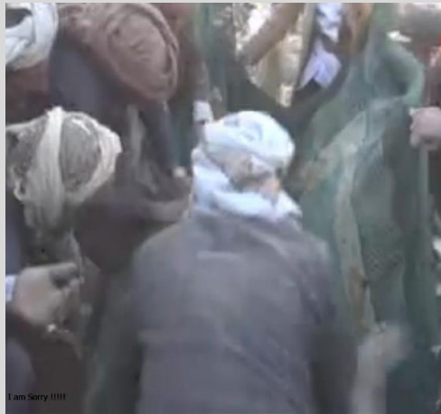
I am Sorry!!!!