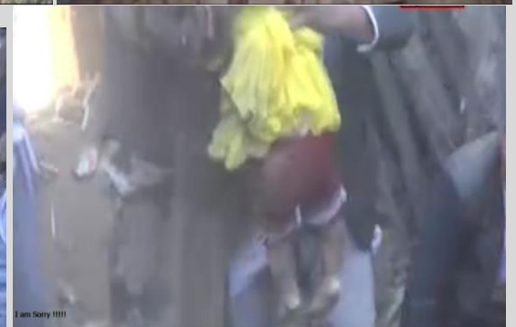
I am Sorry!!!!