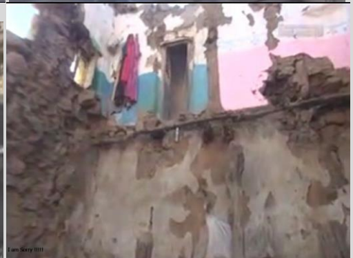
I am Sorry!!!!