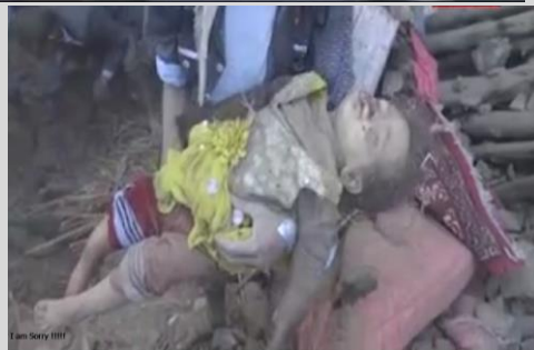
I am Sorry!!!!