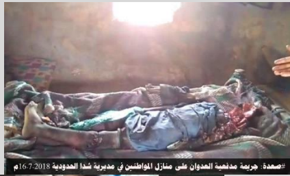
الصعدة: جريمة مدغنية العدوان على منازل المواطنين في مديرية شذا الحدودية 16-7-2018م