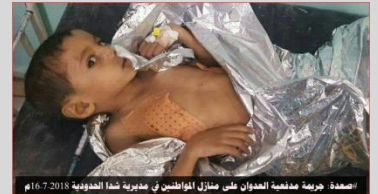
الصعدة: جريمة مدغنية العدوان على منازل المواطنين في مديرية شذا الحدودية 16-7-2018م